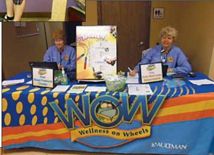
The Aultman WOW van and nurses provide free health screenings and education to our residents and meal guests.